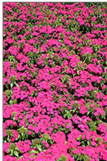
Amazon Neon Cherry Pinks in bloom