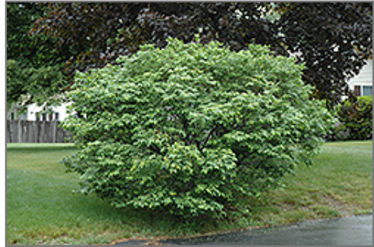
Compact Winged Burning Bush

Compact Winged Burning Bush will grow to be about 7 feet tall at maturity, with a spread of 7 feet. It tends to fill out right to the ground and therefore doesn't necessarily require facer plants in front, and is suitable for planting under power lines. It grows at a slow rate, and under ideal conditions can be expected to live for 50 years or more.