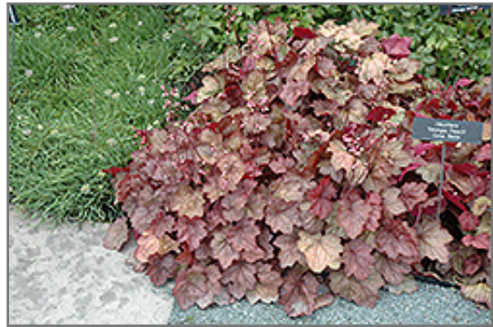
Georgia Peach Coral Bells

Georgia Peach Coral Bells is recommended for the following landscape applications;