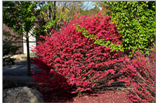
Little Moses Burning Bush in fall