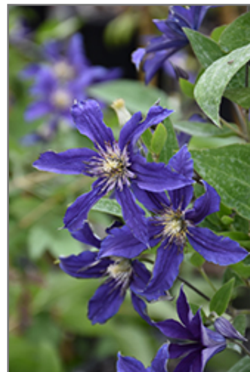
Sapphire Indigo Clematis flowers