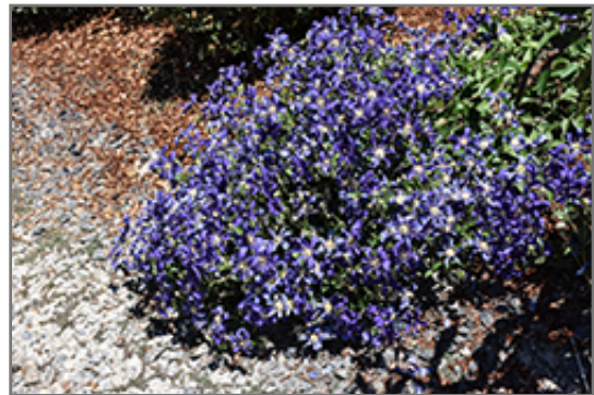
Sapphire Indigo Clematis in bloom