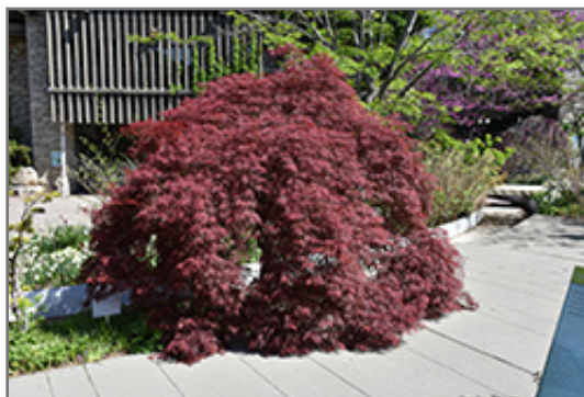
Inaba Shidare Cutleaf Japanese Maple

Inaba Shidare Cutleaf Japanese Maple is recommended for the following landscape applications;