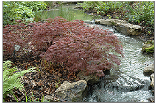
Inaba Shidare Cutleaf Japanese Maple

Inaba Shidare Cutleaf Japanese Maple will grow to be about 8 feet tall at maturity, with a spread of 8 feet. It tends to be a little leggy, with a typical clearance of 2 feet from the ground, and is suitable for planting under power lines. It grows at a medium rate, and under ideal conditions can be expected to live for 60 years or more.