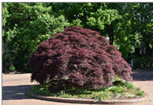
Purple-Leaf Threadleaf Japanese Maple

Purple-Leaf Threadleaf Japanese Maple is recommended for the following landscape applications;