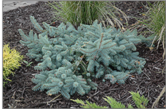
Procumbens Spruce

Procumbens Spruce is recommended for the following landscape applications;