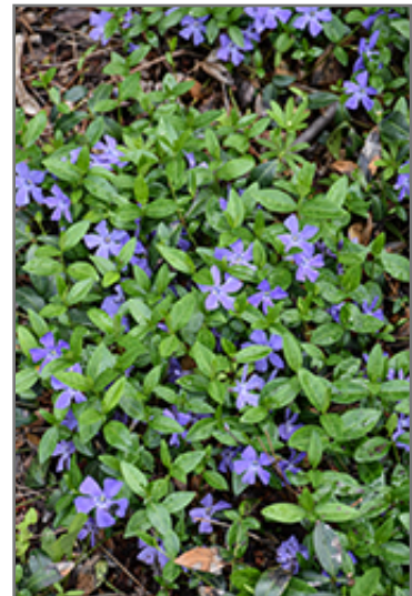
Common Periwinkle flowers