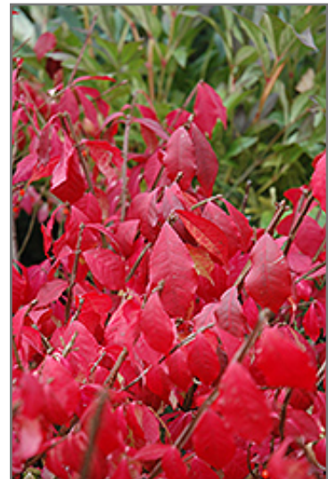
Burning Bush (tree form) in fall