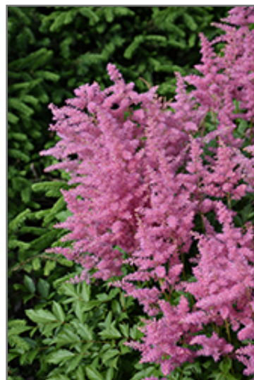
Visions in Pink Chinese Astilbe flowers

Visions in Pink Chinese Astilbe is recommended for the following landscape applications;