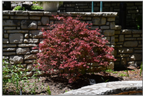
Shaina Japanese Maple

Shaina Japanese Maple is recommended for the following landscape applications;