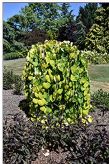
Golden Falls Redbud

Golden Falls Redbud is recommended for the following landscape applications;