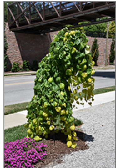
Golden Falls Redbud

This shrub does best in full sun to partial shade. It prefers to grow in average to moist conditions, and shouldn't be allowed to dry out. To help this plant achieve its best flowering performance, periodically apply a flower-boosting fertilizer from early spring through into the active growing season. It is not particular as to soil type or pH. It is highly tolerant of urban pollution and will even thrive in inner city environments, and will benefit from being planted in a relatively sheltered location. Consider applying a thick mulch around the root zone in winter to protect it in exposed locations or colder microclimates. This is a selection of a native North American species.