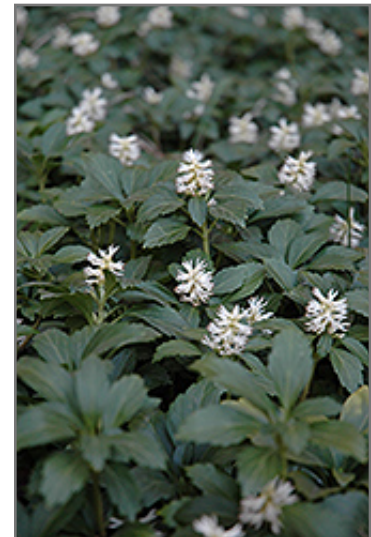
Japanese Spurge flowers