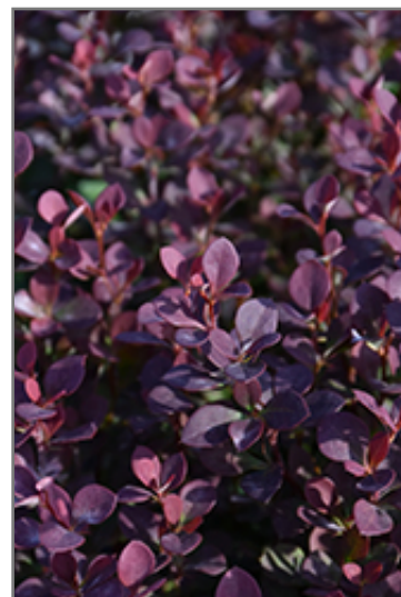
Sunjoy Todo Japanese Barberry foliage