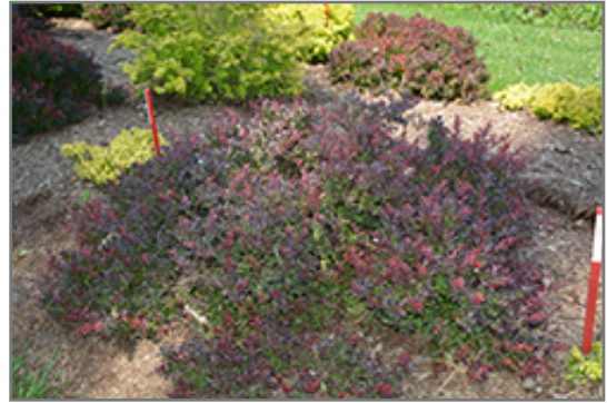
Sunjoy Todo Japanese Barberry

Sunjoy Todo Japanese Barberry will grow to be about 24 inches tall at maturity, with a spread of 24 inches. It tends to fill out right to the ground and therefore doesn't necessarily require facer plants in front. It grows at a medium rate, and under ideal conditions can be expected to live for approximately 20 years.