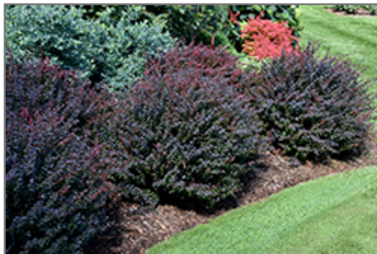
Sunjoy Mini Maroon Japanese Barberry

Sunjoy Mini Maroon Japanese Barberry is recommended for the following landscape applications;