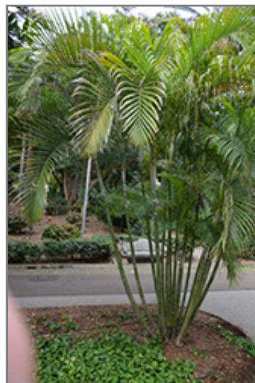
Areca Palm

Areca Palm makes a fine choice for the outdoor landscape, but it is also well-suited for use in outdoor pots and containers. Its large size and upright habit of growth lend it for use as a solitary accent, or in a composition surrounded by smaller plants around the base and those that spill over the edges. It is even sizeable enough that it can be grown alone in a suitable container. Note that when grown in a container, it may not perform exactly as indicated on the tag - this is to be expected. Also note that when growing plants in outdoor containers and baskets, they may require more frequent waterings than they would in the yard or garden. Be aware that in our climate, this plant may be too tender to survive the winter if left outdoors in a container. Contact our experts for more information on how to protect it over the winter months.