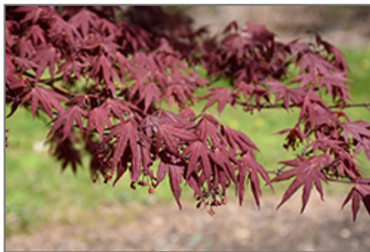
Hefner's Red Select Japanese Maple foliage