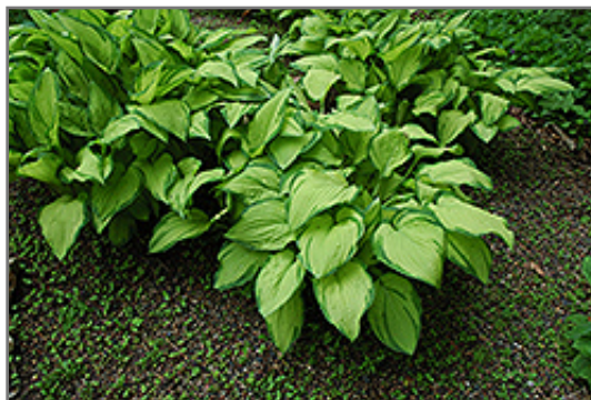
Gold Standard Hosta