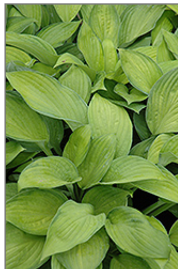
Gold Standard Hosta foliage

Gold Standard Hosta is recommended for the following landscape applications;