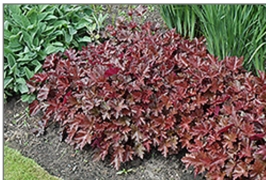
Chocolate Ruffles Coral Bells

This is a relatively low maintenance plant, and should be cut back in late fall in preparation for winter. It is a good choice for attracting hummingbirds to your yard. It has no significant negative characteristics.