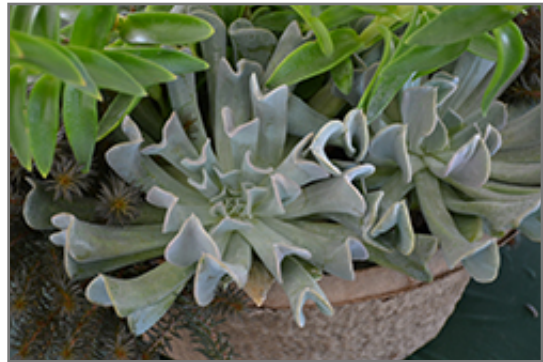
Topsy Turvy Echeveria

This is a dense herbaceous evergreen houseplant with tall flower stalks held atop a low mound of foliage. Its relatively fine texture sets it apart from other indoor plants with less refined foliage. This plant should not require much pruning, except when necessary to keep it looking its best.