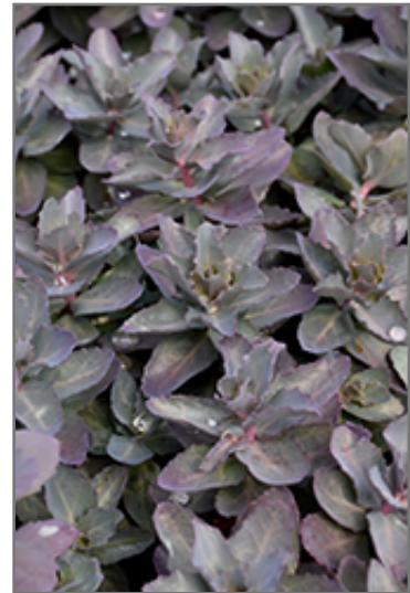
Cherry Truffle Stonecrop foliage

Cherry Truffle Stonecrop is a fine choice for the garden, but it is also a good selection for planting in outdoor pots and containers. It is often used as a 'filler' in the 'spiller-thriller-filler' container combination, providing a mass of flowers and foliage against which the larger thriller plants stand out. Note that when growing plants in outdoor containers and baskets, they may require more frequent waterings than they would in the yard or garden.