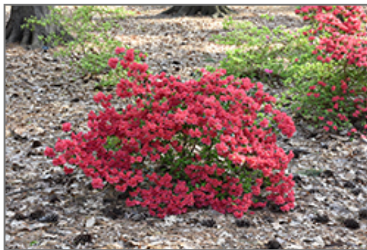
Girard's Crimson Azalea in bloom