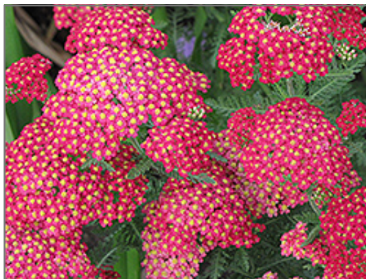
Galaxy Paprika Yarrow flowers

Galaxy Paprika Yarrow is recommended for the following landscape applications;