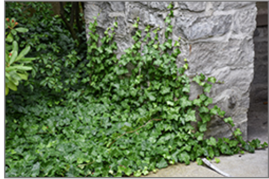
English Ivy

English Ivy makes a fine choice for the outdoor landscape, but it is also well-suited for use in outdoor pots and containers. Because of its spreading habit of growth, it is ideally suited for use as a 'spiller' in the 'spiller-thriller-filler' container combination; plant it near the edges where it can spill gracefully over the pot. Note that when grown in a container, it may not perform exactly as indicated on the tag - this is to be expected. Also note that when growing plants in outdoor containers and baskets, they may require more frequent waterings than they would in the yard or garden.