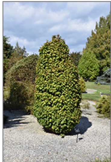
Columnaris Nana Hornbeam