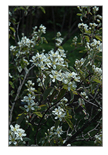
Parkhill Saskatoon flowers