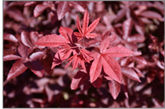
Rhode Island Red Japanese Maple foliage

Rhode Island Red Japanese Maple will grow to be about 12 feet tall at maturity, with a spread of 12 feet. It has a low canopy with a typical clearance of 3 feet from the ground, and is suitable for planting under power lines. It grows at a slow rate, and under ideal conditions can be expected to live for 80 years or more.