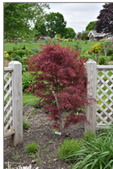
Hubb's Red Willow Japanese Maple