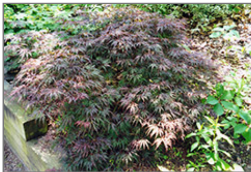
Cutleaf Japanese Maple