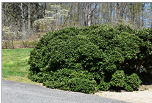
Rotunda Chinese Holly

Rotunda Chinese Holly is recommended for the following landscape applications;