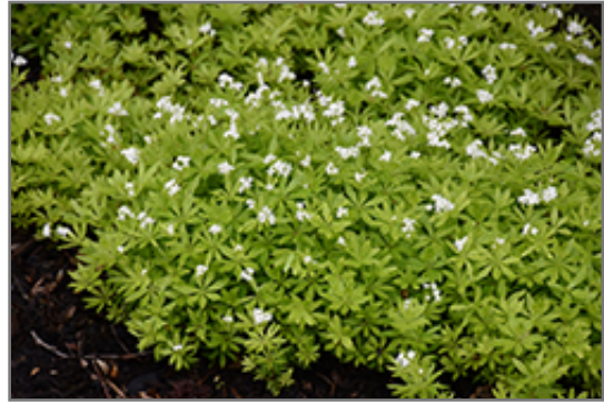
Sweet Woodruff in bloom

This plant does best in partial shade to shade. It prefers to grow in average to moist conditions, and shouldn't be allowed to dry out. It is not particular as to soil type, but has a definite preference for acidic soils. It is somewhat tolerant of urban pollution. This species is not originally from North America. It can be propagated by division.