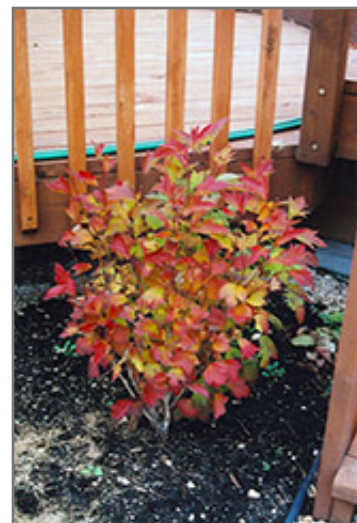
Compact Highbush Cranberry in fall