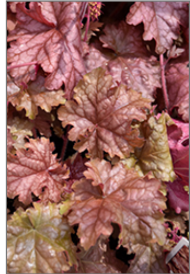
Carnival Peach Parfait Coral Bells foliage

Carnival Peach Parfait Coral Bells is recommended for the following landscape applications;