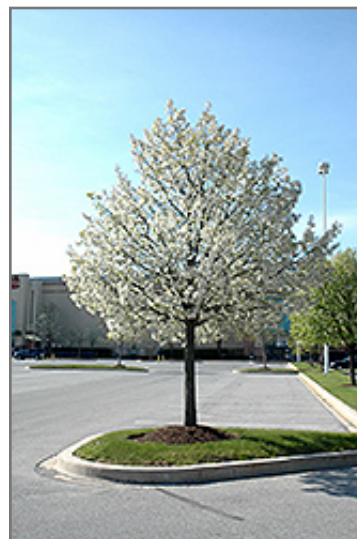
Jack Ornamental Pear in bloom