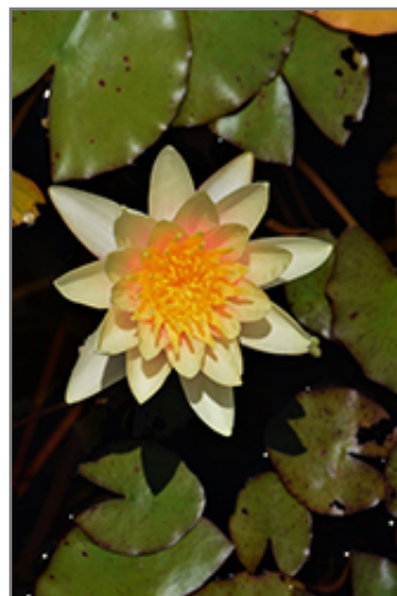
Comanche Hardy Water Lily flowers