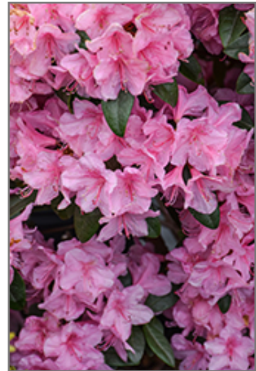
Aglo Rhododendron flowers