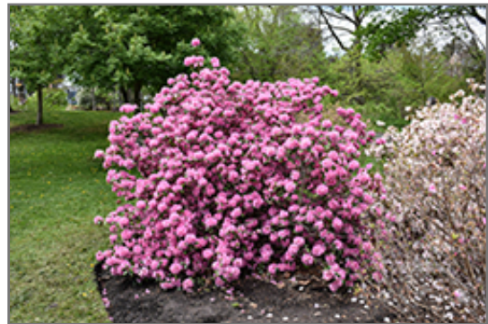
Aglo Rhododendron in bloom