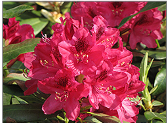
Nova Zembla Rhododendron flowers