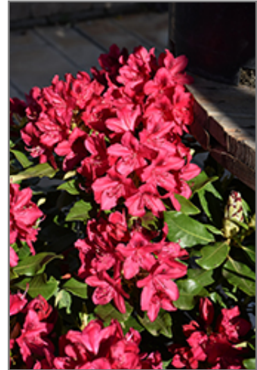
Nova Zembla Rhododendron flowers

This shrub does best in full sun to partial shade. You may want to keep it away from hot, dry locations that receive direct afternoon sun or which get reflected sunlight, such as against the south side of a white wall. It requires an evenly moist well-drained soil for optimal growth, but will die in standing water. It is very fussy about its soil conditions and must have rich, acidic soils to ensure success, and is subject to chlorosis (yellowing) of the foliage in alkaline soils. It is somewhat tolerant of urban pollution, and will benefit from being planted in a relatively sheltered location. Consider applying a thick mulch around the root zone in winter to protect it in exposed locations or colder microclimates. This particular variety is an interspecific hybrid.