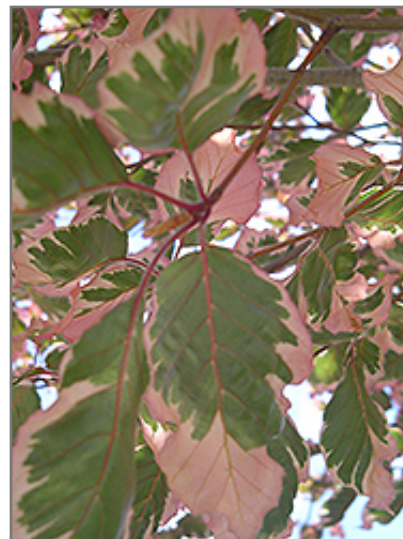
Tricolor Beech foliage