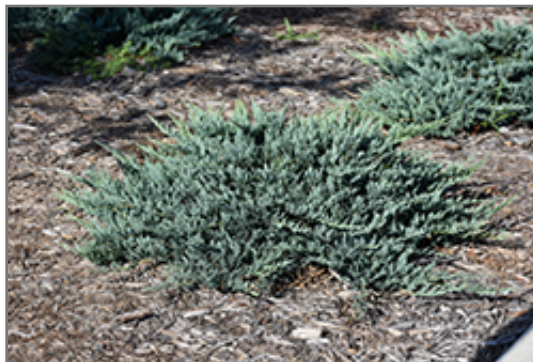
Blue Chip Juniper