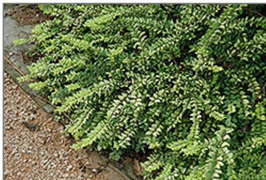
Edmee Gold Honeysuckle