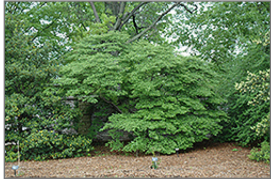
Autumn Glow Winterberry Holly

Autumn Glow Winterberry Holly will grow to be about 8 feet tall at maturity, with a spread of 10 feet. It tends to be a little leggy, with a typical clearance of 1 foot from the ground, and is suitable for planting under power lines. It grows at a medium rate, and under ideal conditions can be expected to live for 40 years or more. This is a female variety of the species which requires a male selection of the same species growing nearby in order to set fruit.