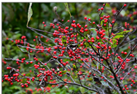
Autumn Glow Winterberry Holly fruit