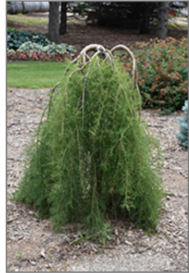
Walker Weeping Peashrub

This dwarf tree does best in full sun to partial shade. It prefers dry to average moisture levels with very well-drained soil, and will often die in standing water. It is considered to be drought-tolerant, and thus makes an ideal choice for xeriscaping or the moisture-conserving landscape. It is not particular as to soil type or pH, and is able to handle environmental salt. It is highly tolerant of urban pollution and will even thrive in inner city environments. This is a selected variety of a species not originally from North America.