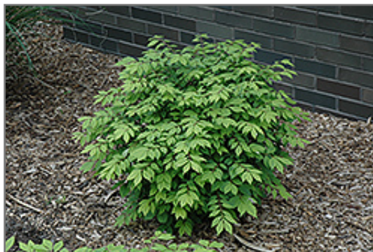
Little Moses Burning Bush