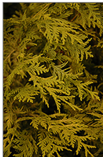
Vintage Gold Dwarf Moss Falsecypress foliage