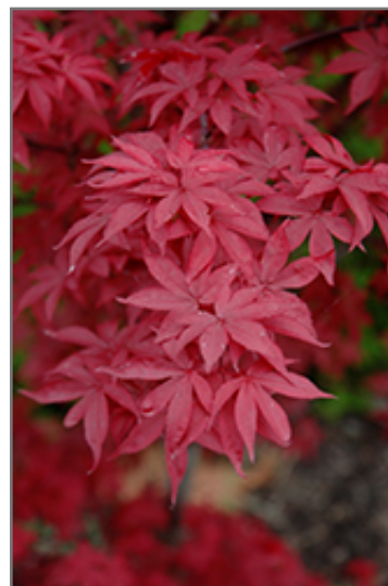
Twombly's Red Sentinel Japanese Maple foliage