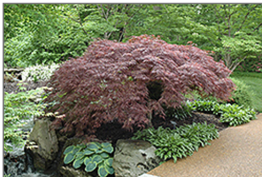
Red Select Japanese Maple