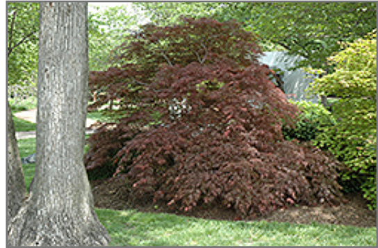
Garnet Cutleaf Japanese Maple

Garnet Cutleaf Japanese Maple will grow to be about 10 feet tall at maturity, with a spread of 8 feet. It has a low canopy with a typical clearance of 1 foot from the ground, and is suitable for planting under power lines. It grows at a fast rate, and under ideal conditions can be expected to live for 60 years or more.