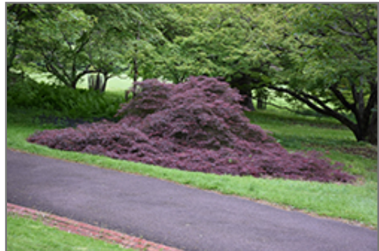
Garnet Cutleaf Japanese Maple