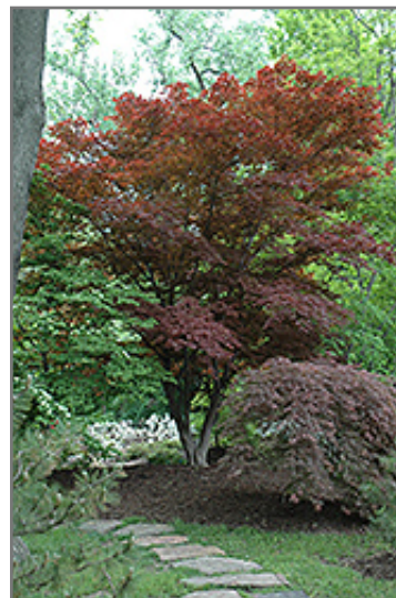
Oshio Beni Japanese Maple