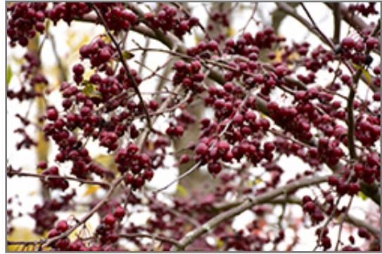
Purple Prince Flowering Crab fruit

This tree should only be grown in full sunlight. It prefers to grow in average to moist conditions, and shouldn't be allowed to dry out. It is not particular as to soil type or pH. It is highly tolerant of urban pollution and will even thrive in inner city environments. This particular variety is an interspecific hybrid.