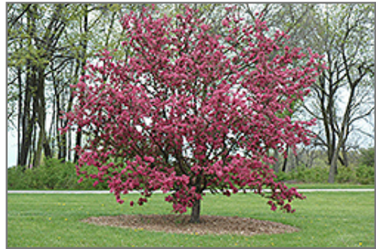
Purple Prince Flowering Crab in bloom

This tree will require occasional maintenance and upkeep, and is best pruned in late winter once the threat of extreme cold has passed. It is a good choice for attracting birds to your yard. It has no significant negative characteristics.